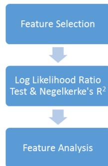
Figure 3. Feature Influence Process Flow

Fig. 2 illustrates a general framework for wrapper methods that were used at this stage to find the selected features out of 52 features. Three components are involved according to the figure which are Feature search, Feature evaluation, and Classification.